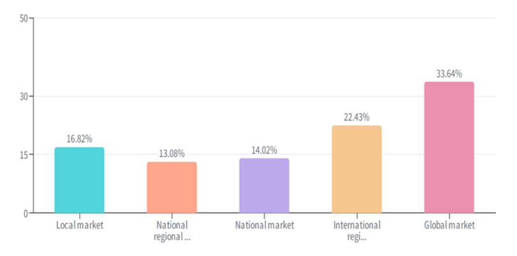
Figure 3. Respondent profile: Location of suppliers

Bearing in mind the specificity of the research problem, it was interesting to see if there are different perceptions about the importance of the VS criteria among companies that have suppliers from the local and national markets, compared to companies that mainly deal with suppliers outside national borders. Figure 3 shows the percentage of participation of companies in the research from the aspect of the location of their suppliers.